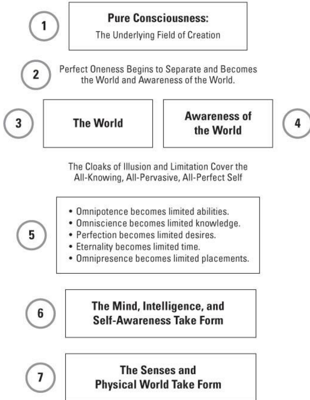
Figure 14-1: A map of the stages of universal creation.